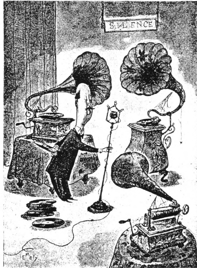
"... and now a selection of tunes from the Edwardian Era on gramophone records . . ."